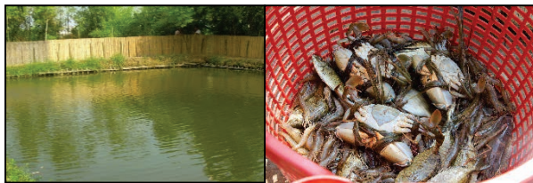
Figure 5. Bamboo fence surrounding pond and the products

In spite of the severity of disasters, the people have coping strategies. In Huong Phong, aquaculture is one of their livelihoods especially for the people living near Tam Giang lagoon. Similar to the livestock in Huong Van, people sell the cultured fish before rainy season at lower price because they are afraid of the loss. The project showed the bamboo fence surrounding aquaculture pond which prevents fish from being swept away during inundation. Eight farmers made fence, as a result, they kept the fish during inundation and sold it at higher price after rainy season (see Figure 5). Another strategy is the diversification of income sources. The main income sources of Huong Phong are aquaculture of shrimp, fish, or crab and rice production. If the local people depend on monoculture as their livelihood, they will largely suffer when the disaster cause severe damages on the product. By using the rice straws, byproduct of producing rice, some people initiated mushroom production. They built the house made of rice straw and grew oyster mushroom in the house, keeping warm temperature and humidity in the house (see Figure 6). Also, some people try to culture a type of eels which can grow in the paddy field to diversity their income sources. In this way, the local people try their coping strategies in order to avoid the loss or decrease of income during the rainy season with the utilization of local resources.