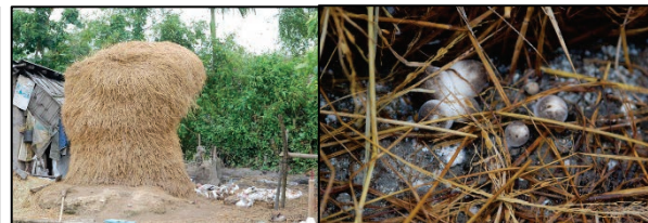
Figure 6. Rice straws and mushroom with the straw