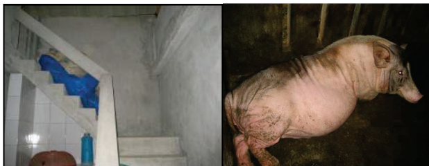
Figure 3. Two-story pig pen and sow

Also, feed for pig is one of the important issues for pig farmers in Houng Van, especially in rainy season when local people have difficulty in cooking cassava as the feed. HUAF organized the training of producing fermented cassava as pig's feed and conducted trials at key farmers' house. The fermented cassava put in nylon bag can be kept under ground for seven to eight months without being affected by floods. Cassava is usually harvested in the rainy season in Huong Van, so local people can make use of local resource and ensure the feed for pigs during rainy season. Around 200 pig farmers in Huong Van use fermented cassava in the flood season in 2009 (see Figure 4).