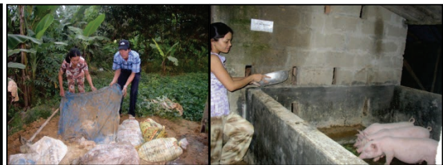
Figure 4. Fermented cassava for pigs